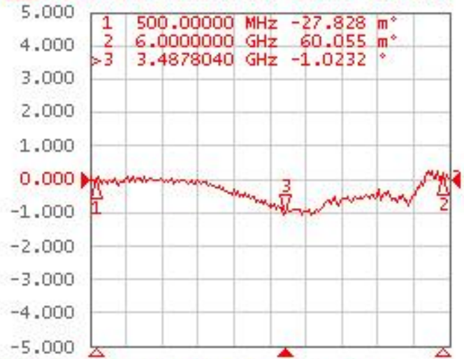
Tr2 S12 Phase 1.000°/ Ref 0.000° [F2 D/M]