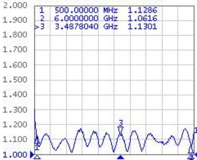
Tr1 S11 SWR 100.0m/ Ref 1.000 [F2]